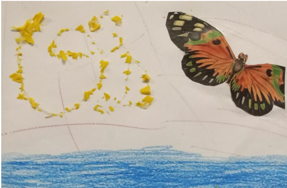
collage by Dayana, workshop, AMBH, Lisbon, 2024