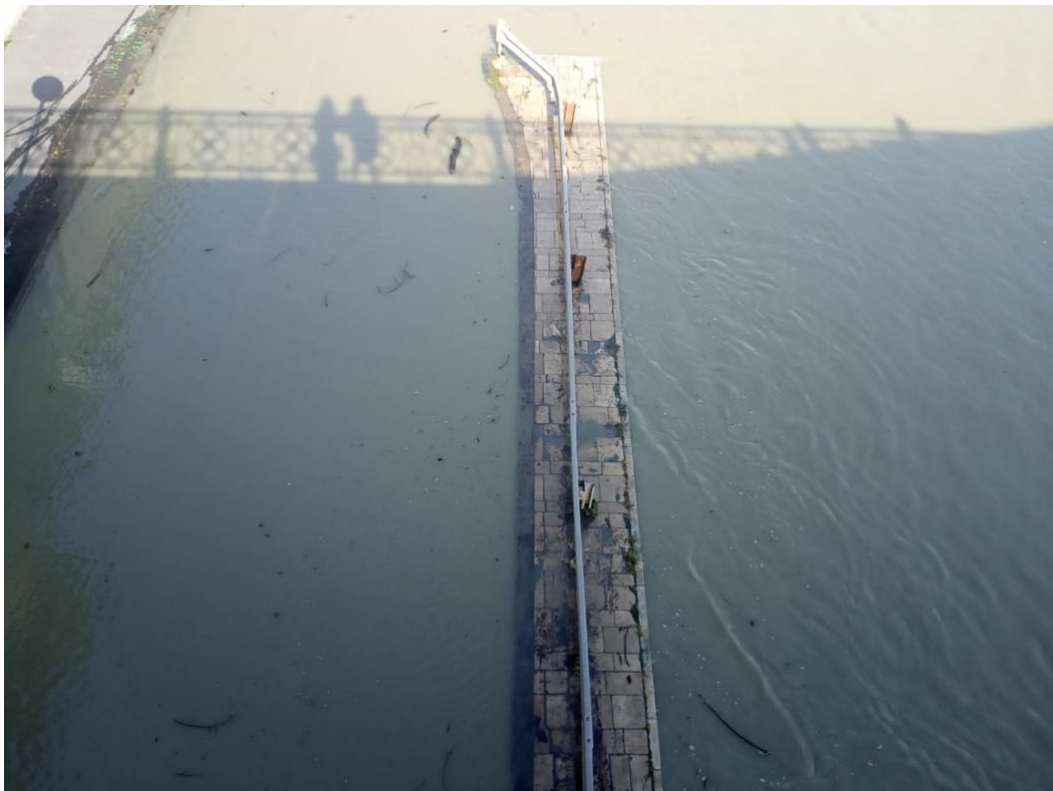
Budapest, 2024, during the flood

The truth depends on where and from where you look.